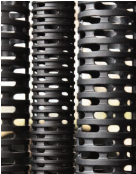
One of the most difficult-to-mold products is this glass-reinforced nylon fuel filter tube.